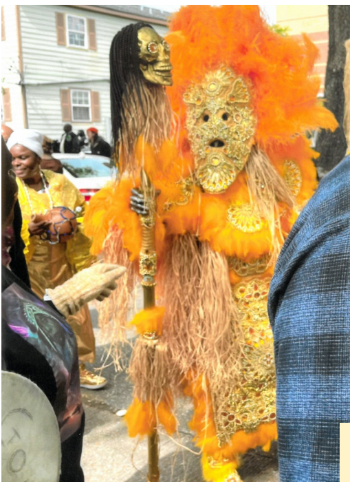
Palm Sunday Children's Message (above). New Orleans trip (left).