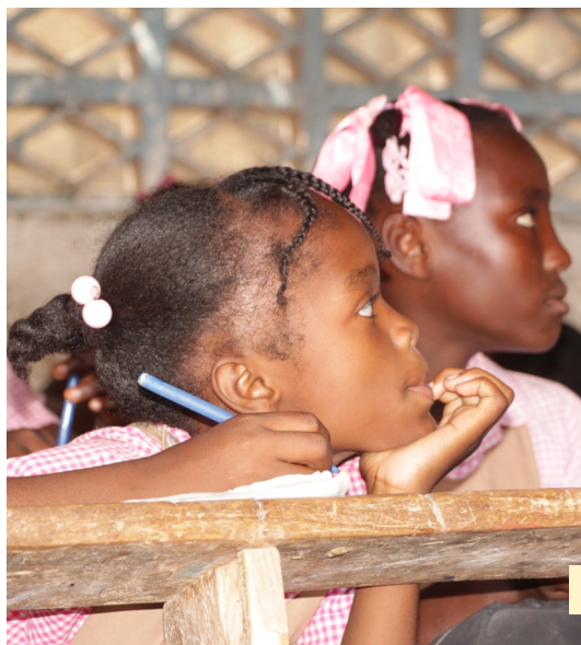
Students in Haiti.

The food distribution program that we began due to the increased food insecurity continues. Over 150 people and their families receive a bag of food once a month from this distribution. We thank the Mission Board for their support of this program and for their continued support of our scholarship program through the years. Support such as this keeps us going and gives the Haitian people hope in knowing that our church community cares about their lives.