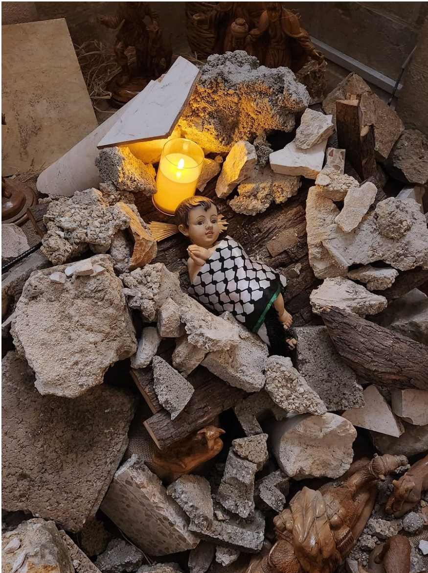
“Baby Jesus in the Rubble of Gaza”

The First Congregational Church of Old Lyme