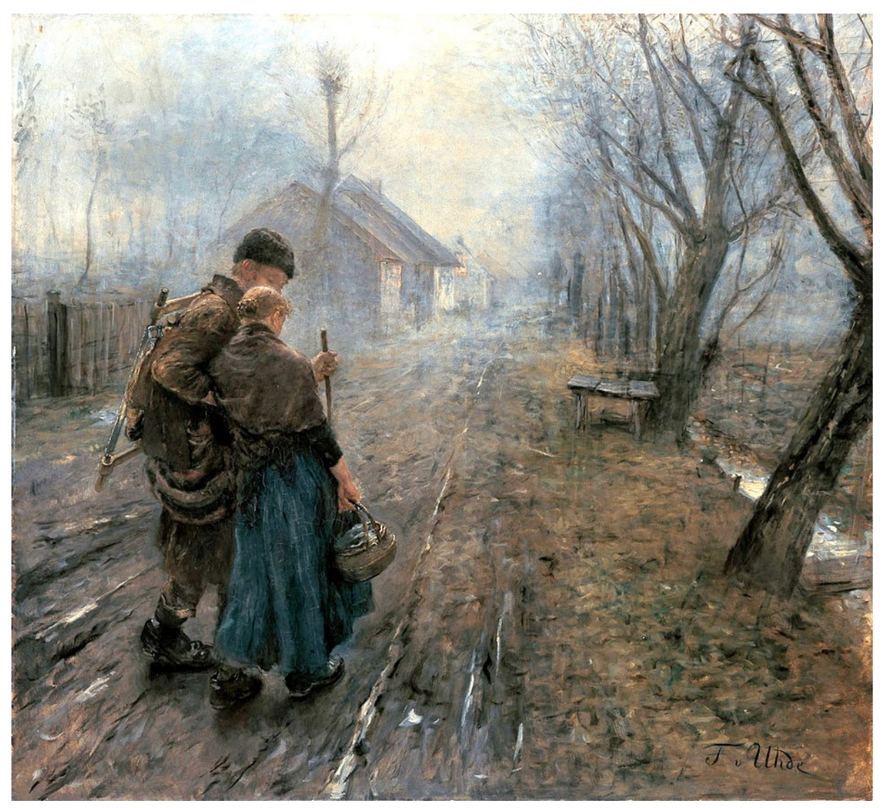
Difficult Journey - Transition to Bethlehem, by Fritz von Uhde, 1890