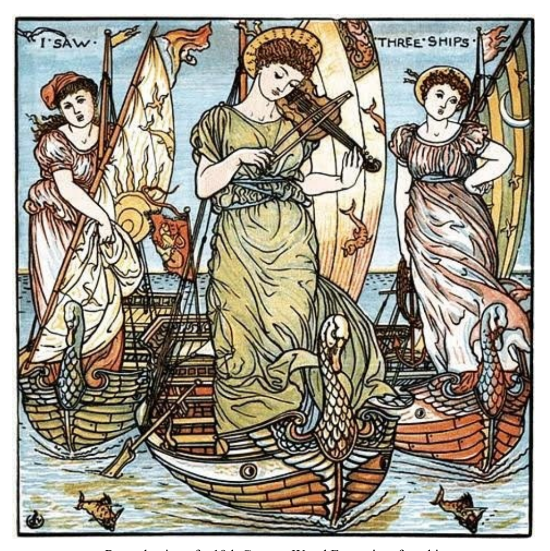
Reproduction of a 19th Century Wood Engraving, found in "Walter Cranes Painting Book" 1889.