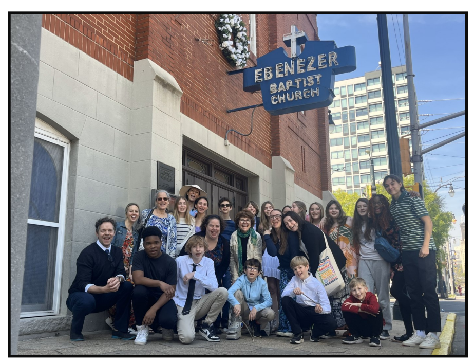
The Civil Rights Group attended The Ebenezer Baptist Church in Atlanta, Georgia.

On that day, when evening had come, he said to them, "Let us go across to the other side." And leaving the crowd behind, they took him with them in the boat, just as he was. Other boats were with him.