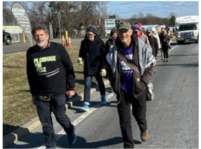
A March from Philadelphia to Washington D.C. calling for Peace in Gaza