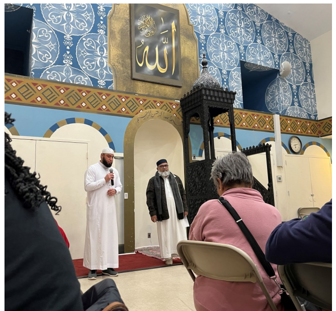
The Islamic Center of Delaware hosted Pilgrims one Evening