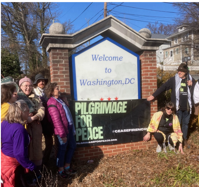
The Marchers made it to D.C.!