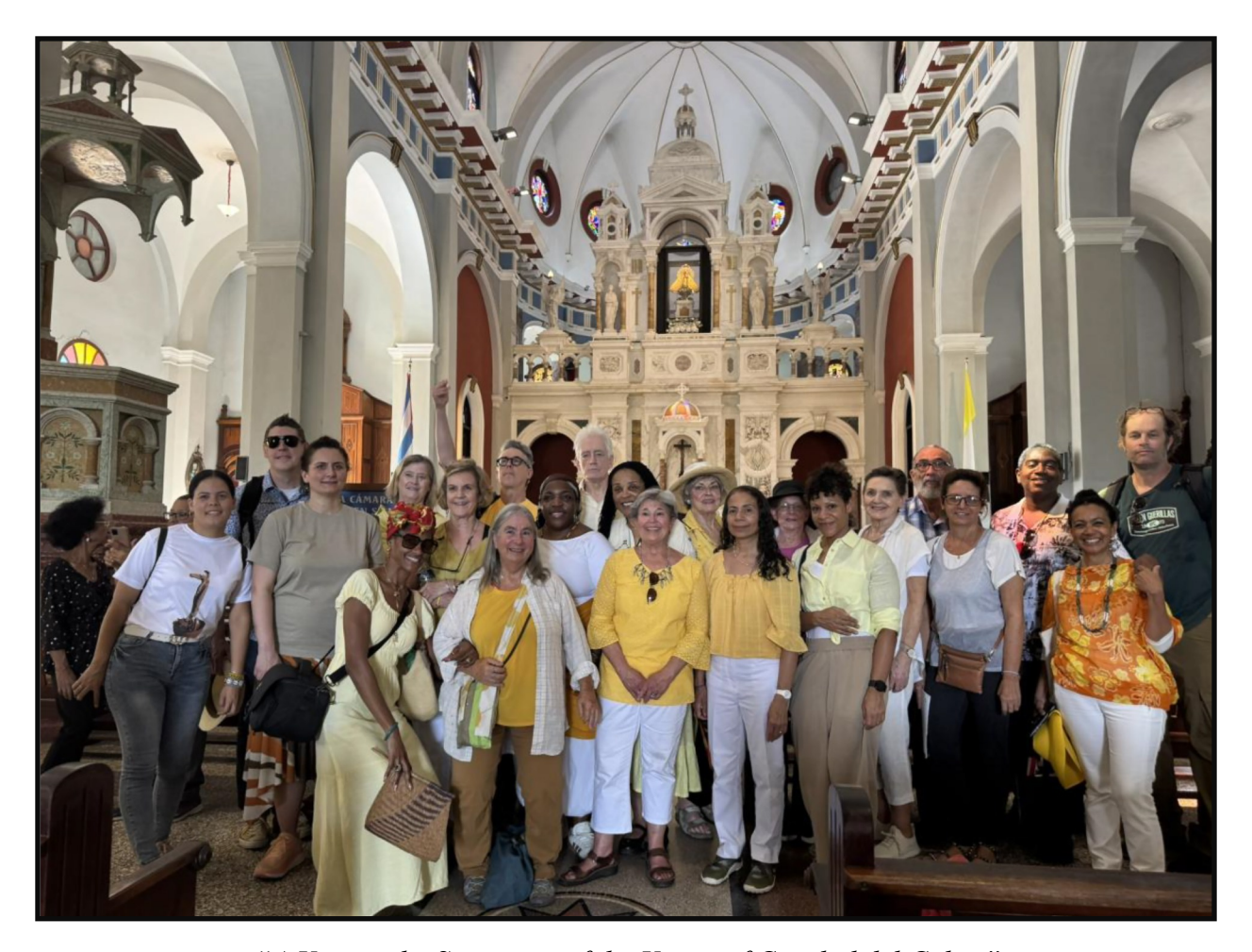
"A Visit to the Sanctuary of the Virgin of Caridad del Cobre"