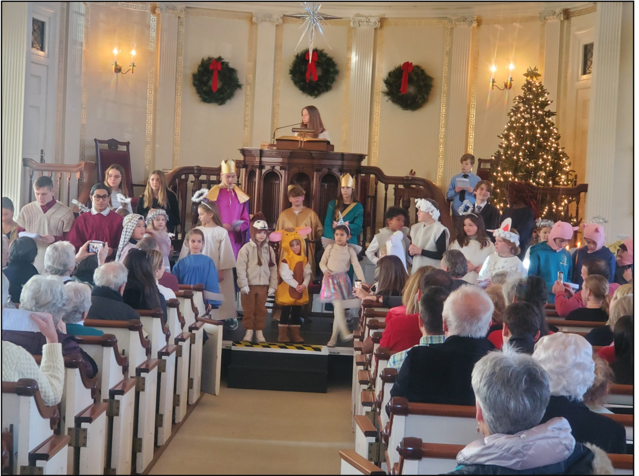
FCCOL Christmas Pageant