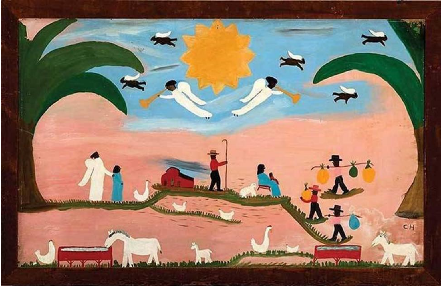
The Annunciation and the Adoration of the Wise Men, 1957, Clementine Hunter (1886/87–1988)